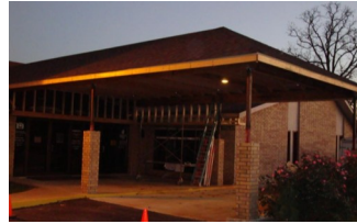
Check out the new roof!

available to help in finishing up this project, we'll be sure to let you know.