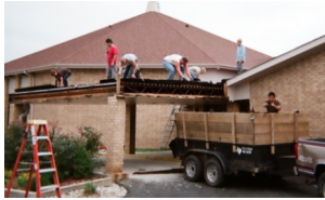
October Work Day Tear Down

Each week it is looking better and better! Special thanks go out to all who have volunteered